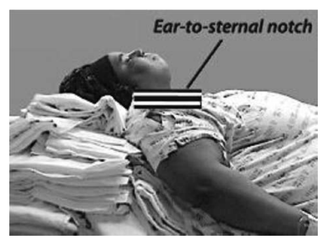
Figure 1: Ear-to-sternal notch position

position also helps to keep the breasts away during laryngoscopy.