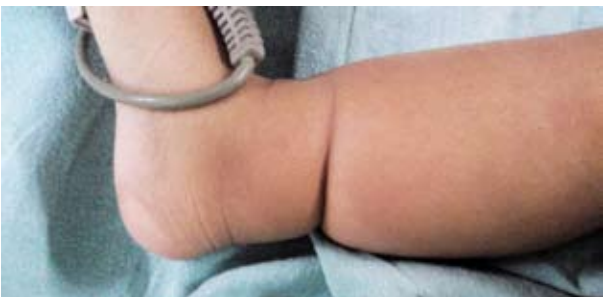
Figure 1: A partial band on right leg (medial side)

Perioperative management of amniotic band syndrome