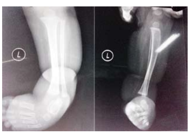
Figure 4: Left leg; AP and lateral views

also normal. Other body systems were normal. Routine laboratory investigations, e.g. hemoglobin, hematocrit, white blood cell count, electrolytes and urine analysis were within normal limits. Chest x-ray (PA view), 12 leads ECG, USG whole abdomen