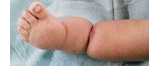
Figure 2: A complete band on left leg