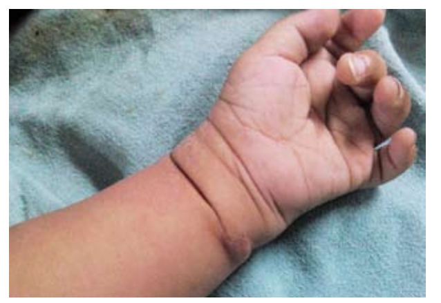
Figure 3: A band on left fore arm