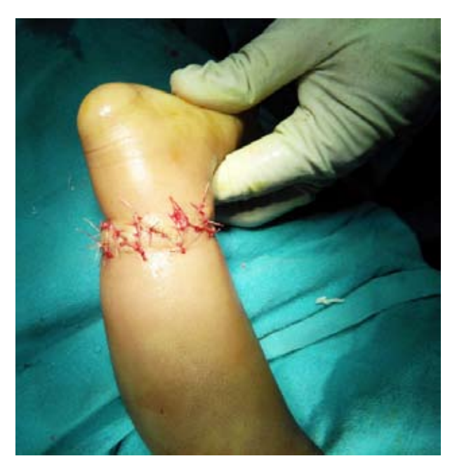
Figure 6: Z-plasty done

and 2D echocardiography were all within normal limits. Skiagram of his limbs showed soft tissue constriction without involvement of the bones. Doppler study of the limbs revealed normal blood flow in all the vessels, as well as at the constriction