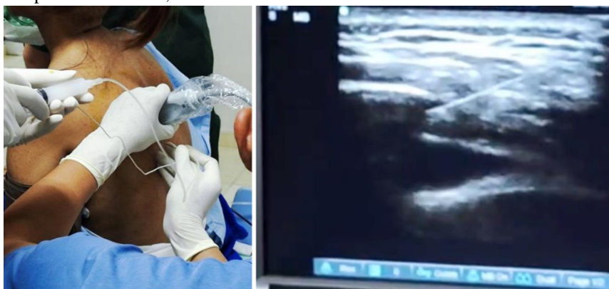
Figure 1: Placement of probe and needle in 7th Left Posterior Costae and In-plane approach

On the eighth day of the hospital stay, the patient underwent an intercostal nerve block (ICNB) at the left 7th and 10th ribs under ultrasound guidance. The procedure is illustrated in Figure 1 for 7th rib and Figure 2 for 10th rib. We injected 10 mL of ropivacaine 0.75% and triamcinolone 20 mg into each costal segment. Two hours post-procedure, she reported a decrease in her NRS score to between 4-5