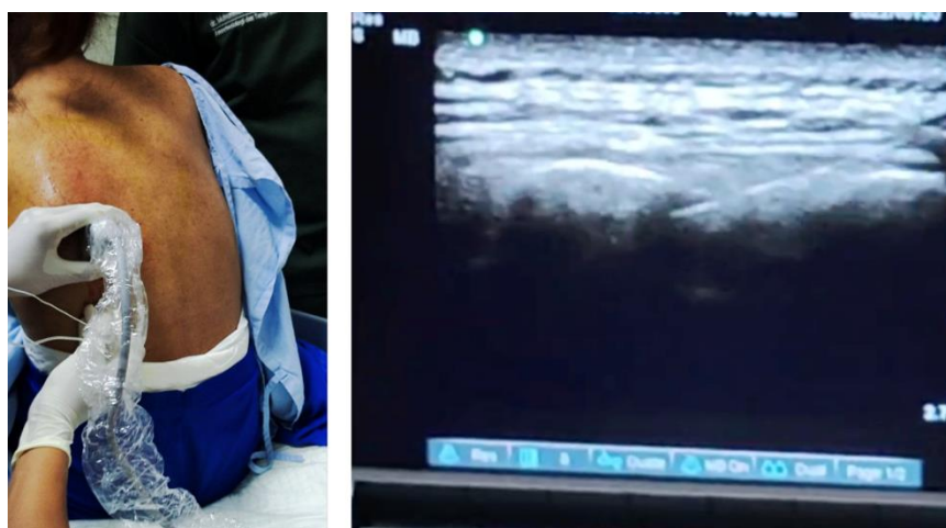
Figure 2: Placement of probe and needle in 10th Left Posterior Costae and In-plane approach