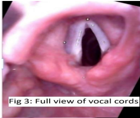
Fig 3: Full view of vocal cords

laryngoscope blade and camera lens in partially restricted glottic view affords wider field of view allowing earlier visualisation and redirection of the advancing ETT. In addition, this view decreases the viewing angle, allows the glottis to drop which further helps in the redirection of ETT and hence makes intubation easy. 5