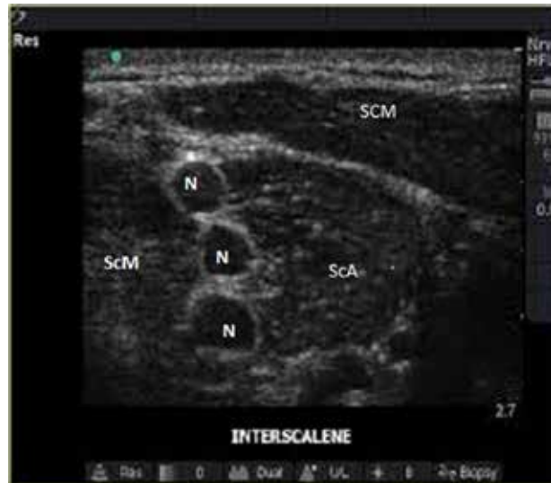
Figure 1- Interscalene region sonoanatomy showing brachial plexus roots (N) as hypoechoic nodules between two muscles.

A High frequency linear probe (8-13 MHz) is used to scan the neck transversely between the level of cricoid cartilage and supraclavicular fossa. At the interscalene level, the brachial plexus roots often appear as hypoechoic nodules