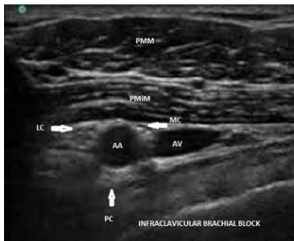
Figure 3: Infraclavicular region sonoanatomy showing cords of brachial plexus as hyperechoic structures around axillary artery.

PMM= Pectoralis major, PMiM= Pectoralis minor, AA= Axillary artery, AV= Axillary vein, MC= Medial cord, PC= Posterior cord, LC= Lateral cord.