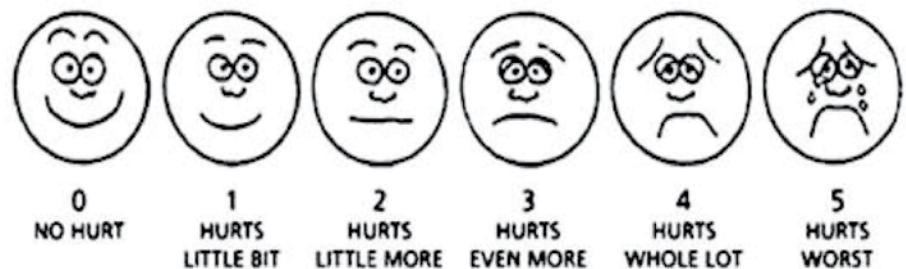
Figure 1: Wong-Baker FACES pain rating scale

Pain assessment scale: The Wong-Baker FACES pain rating scale was used in this study to measure pain after delivering inferior alveolar block injection. Children were asked to choose one of the scale's faces that best described how they felt during the procedure (Figure 1).