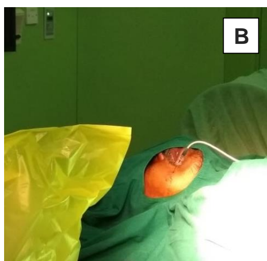
Figure 1. Procedure: (A) administration of 1 mL lidocaine 2%, (B) RFA procedure on the lateral view of C-arm fluoroscopy

and nine subjects had neuralgia for more than 6 months. Drugs used were: CBZ (200 - 400 mg/ day), GB (150 – 600 mg/ day), and TCA (amitriptyline 12.5 – 50 mg/ day). The potential complications were: worsening of the facial motor weakness, diminished corneal reflex, hypoesthesia, persistent pain, hypersensitive reaction to local anesthetic (lidocaine), antibiotic, or RF materials.