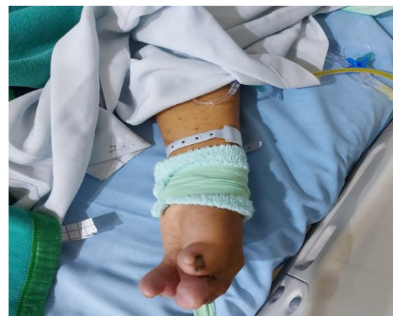
Figure 2: Upper limb syndactyly in the patient