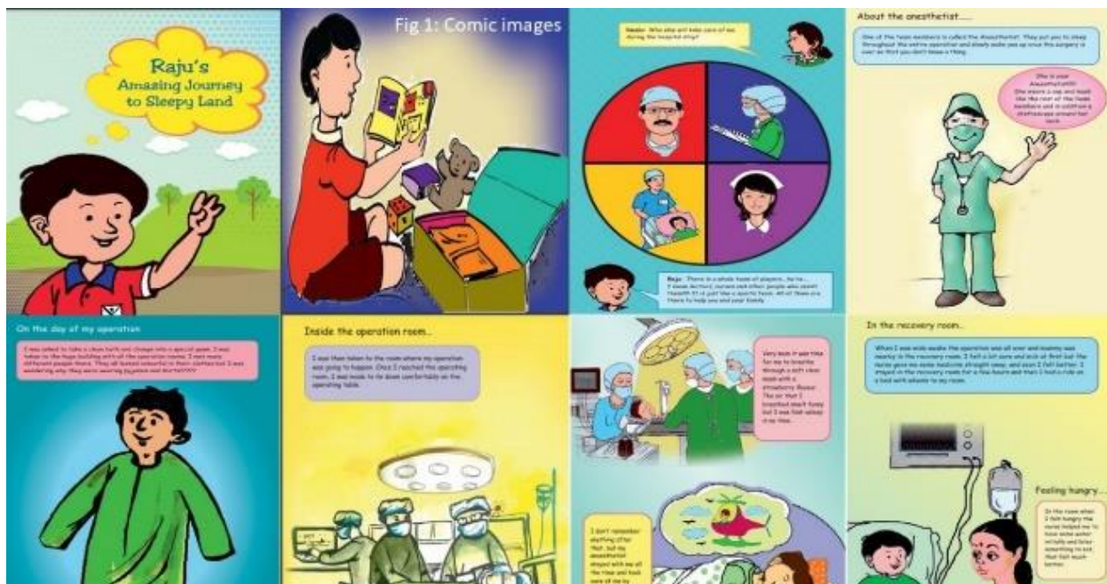
Figure 1: Images of Pediatric Anesthesia Comic Information Leaflet

prior to the surgery. Fasting status was confirmed and duration of fasting noted in all children. Just before shifting to the operating room, the parent separation anxiety was assessed by observer-2 using Parent Separation Anxiety Scale. 11-12 If the score was \geq 2 , anxiolysis was advised with either midazolam, 0.05 mg/kg IV (if intravenous cannula was already secured) or oral midazolam 0.5 mg/kg in paracetamol syrup 20 mg/kg (if there was no cannula).