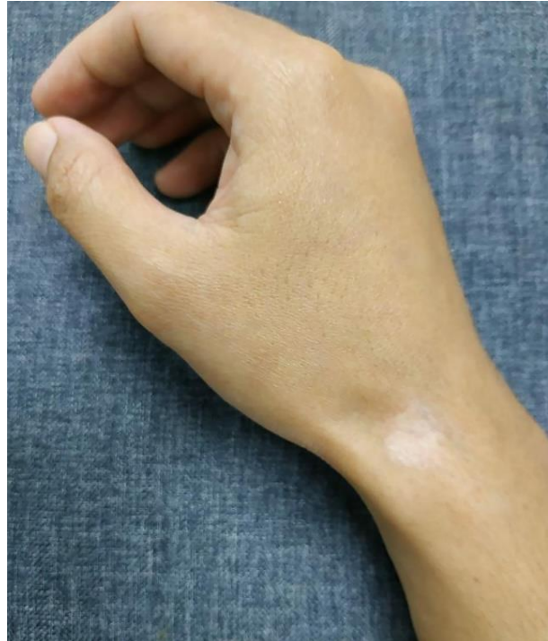
Figure 1: Skin hypopigmentation and subcutaneous fat atrophy associated with corticosteroid injection around the injection site

Corticosteroid injections are a well-established treatment modality in alleviating symptoms of de Quervain's tenosynovitis. 15 These are increasingly being used for other musculoskeletal and rheumatic conditions. 13 Yet, the adverse effects of corticosteroid injections have not been given much attention. Direct corticosteroid injections to the lesion site may avoid many of the