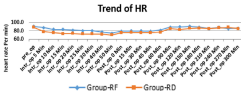
Figure 1: Comparative changes in heart rates