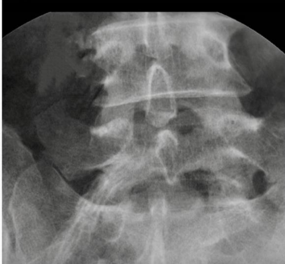
Figure 1: X-ray of lumbosacral region showing abnormal joint on both side

sacral and sacroiliac joint area provoked by superficial and deep palpation. Muscle power, sensations and reflexes were intact bilaterally in lower limbs. Patrick test, pelvic compression test and straight leg raising tests were negative.