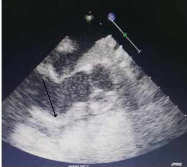
Figure 1: The transesophageal echocardiographic image demonstrating the presence of newly formed clot in the LV cavity. LA cavity also showing the presence of clot