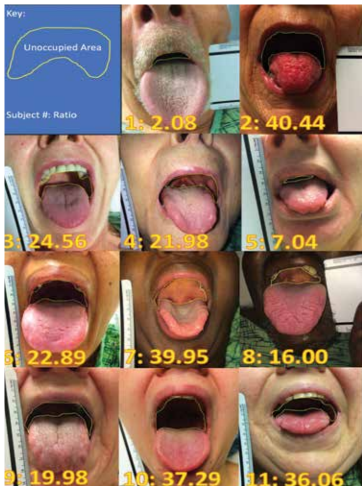
Figure 2: The variability between the size and shape of the tongue, as well as the unoccupied area. The unoccupied area is outlined in yellow, using the ImageJ software, and the first number represents the subject number of the patient followed by the ratio of unoccupied area to the entire oral cavity